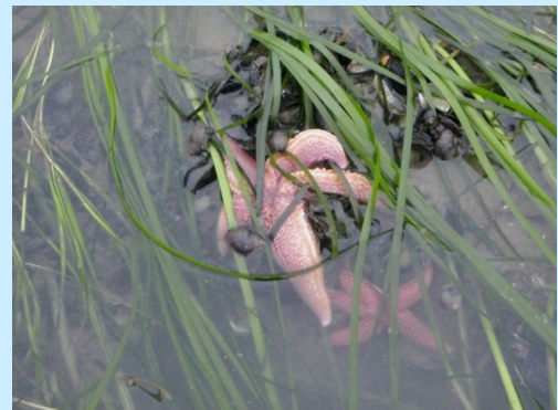
From: Frenchman Bay Partners Market-Based Approach Report Nov. 2013

Fishermen Shellfish Harvesters Seafood Dealers Aquaculture Owners & Operators Municipalities Tourism-Related Businesses Realtors Developers Shorefront Property Owners Educators and Students Researchers Residents Visitors