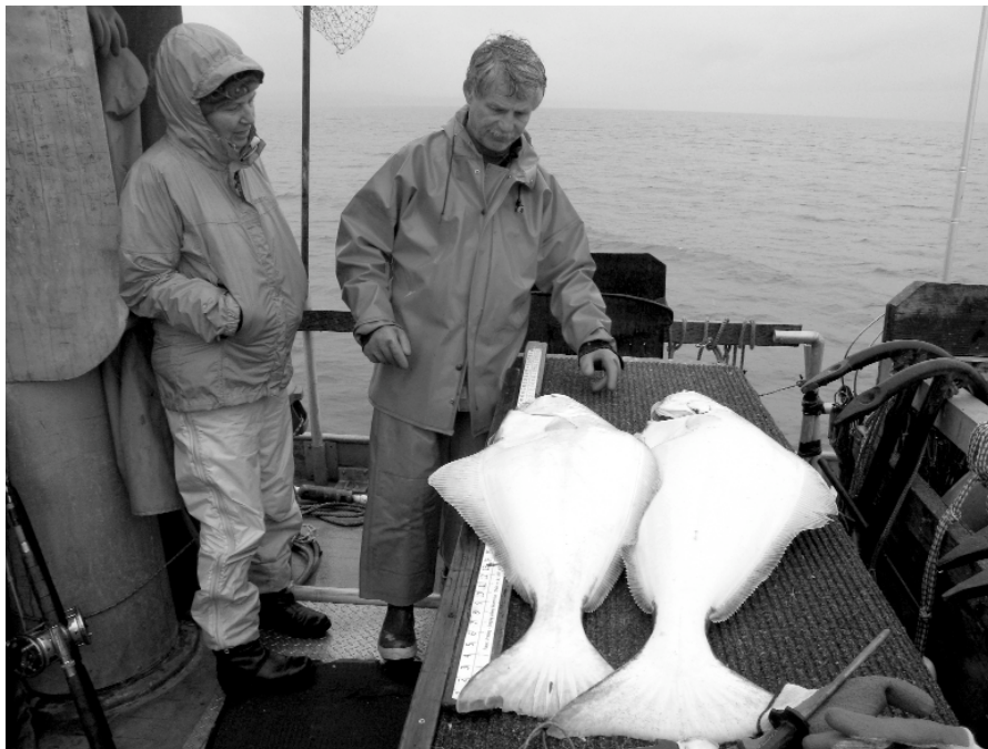
Alaskan halibut caught under the economically and environmentally sustainable catch-shares program.

In 1995, the NPFMC tried something new. The council abandoned the idea of trying to control the length of