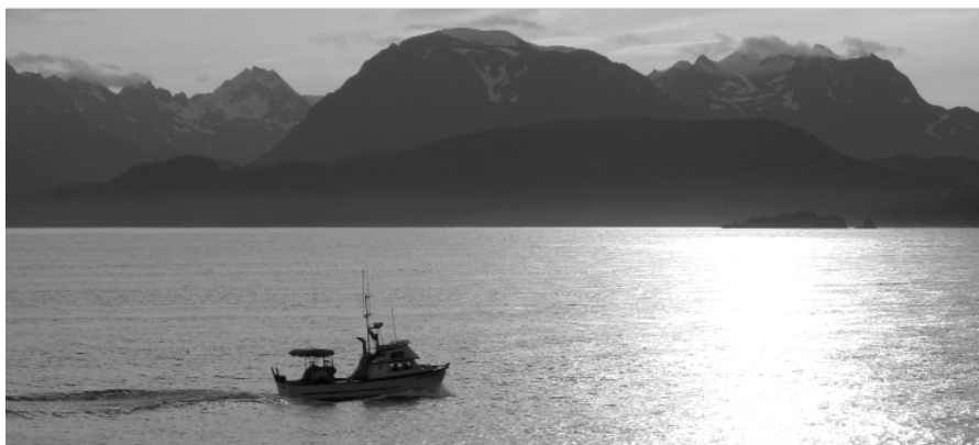
A fishing boat heads to sea from Homer, Alaska, the "halibut fishing capital of the world."

It's a textbook case of the tragedy of the commons. Fish don't live on private property where individual owners can thoughtfully control the harvest. They swim in communal waters,