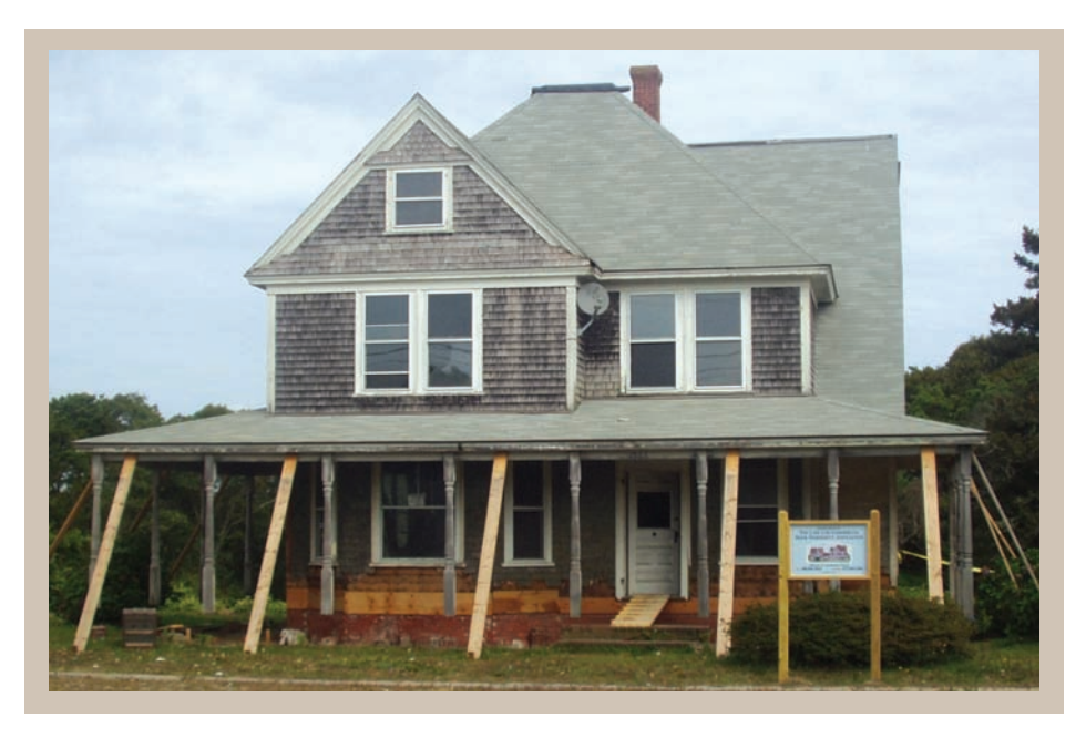
Captain Harding House under renovation.