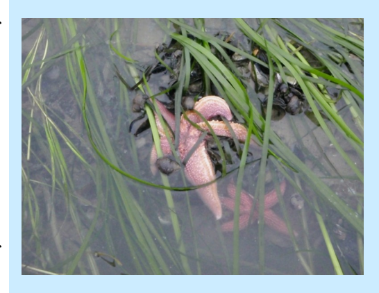
From: Frenchman Bay Partners Market-Based Approach Report Nov. 2013

Shellfish Harvesters Seafood Dealers Aquaculture Owners & Operators Municipalities Tourism-Related Businesses Realtors Developers Shorefront Property Owners Educators and Students Researchers Residents Visitors